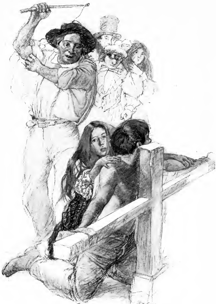
She flung herself in front of MacDougall.—Page 110